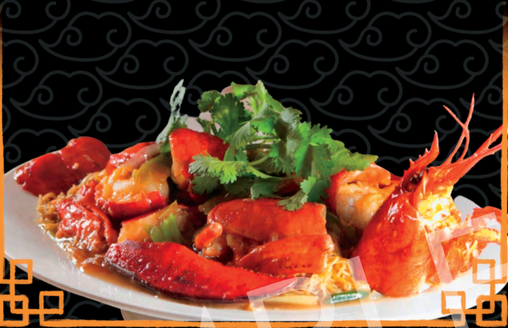
薑蔥龍蝦麵底 Lobster with Ginger and Spring Onion with Noodle S.P