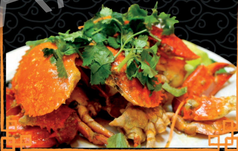
薑蔥炒蟹 Crab with Ginger and Spring Onion £32.00 避風塘炒蟹 Crab with Chilli and Garlic * £32.00